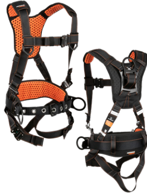
2 3D, QC Chest/Legs