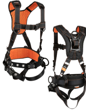
3 3D, QC Chest, TB Legs