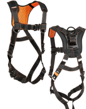
7 1D, QC Chest/Legs