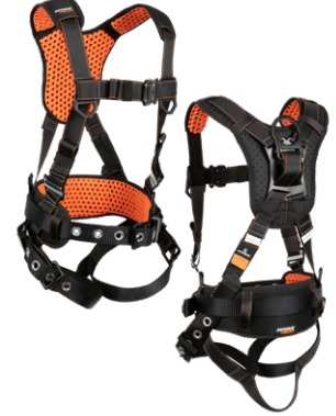
4 1D, QC Chest, TB Legs