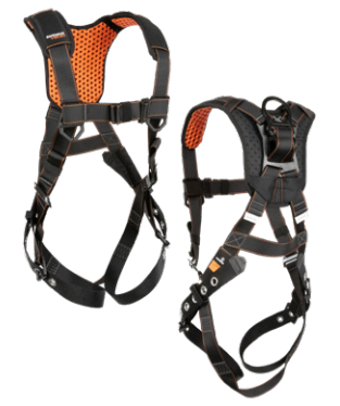
9 1D, MB Chest, TB Legs