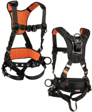
1 3D, QC Chest, FD, TB Legs