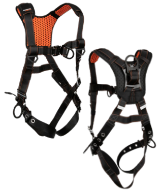
5 3D, QC Chest, FD, TB Legs