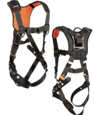
8 1D, QC Chest, TB Legs