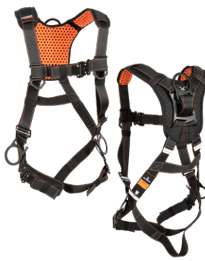
6 3D, QC Chest/Legs