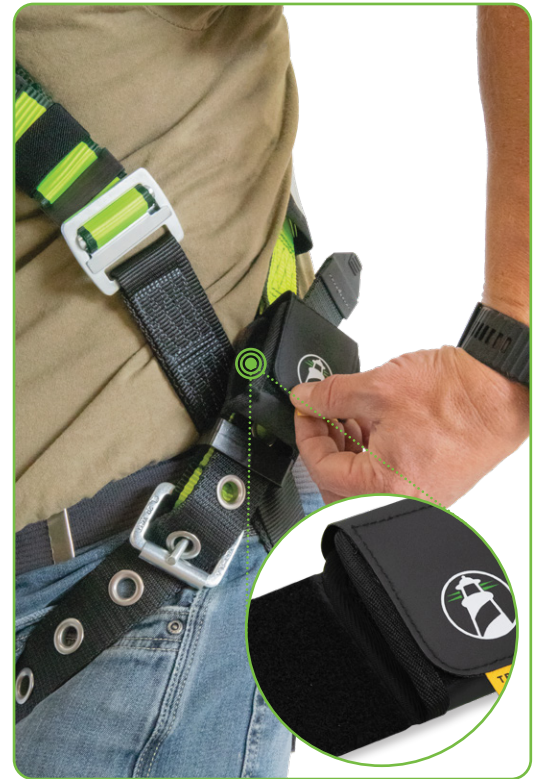
Securely attaches in seconds with Velcro to torso webbing on most harnesses