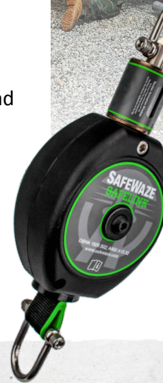
StopLink Brake V2 with Integrated Tension Indicator