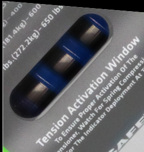
For use with most cable and rope HLLs.